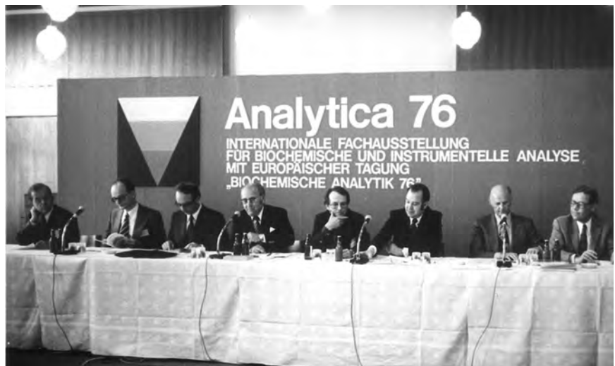
Main press conference at analytica 1976.