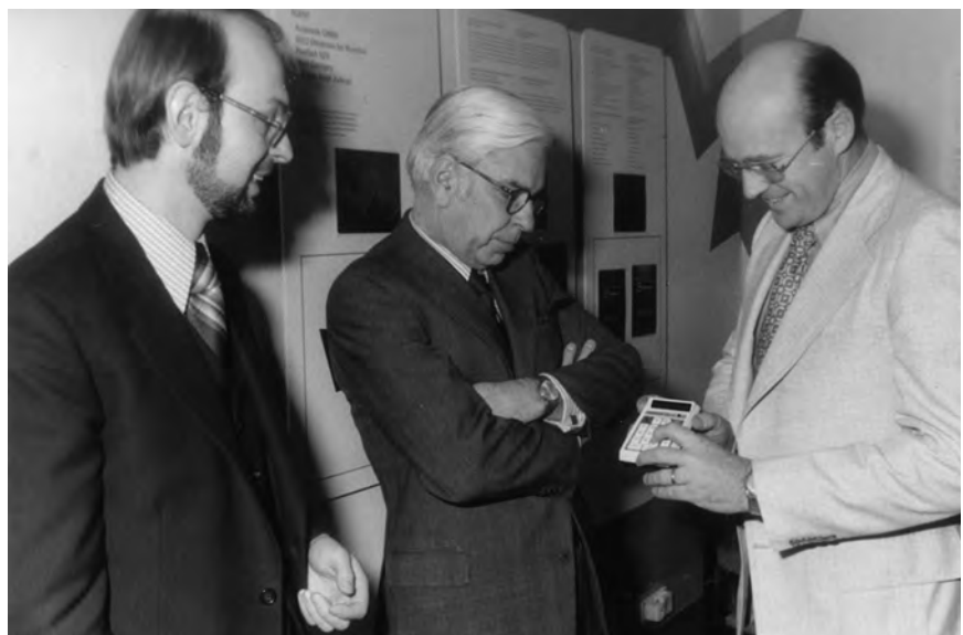
Miniaturization has already been a hot topic at analytica 1972.

Analysen"), which covered a total area of 5,000 sq m (1¼ acres) on the old trade fair grounds at the Theresienwiese in Munich (widely known as the location of the Oktoberfest). Quickly the decision