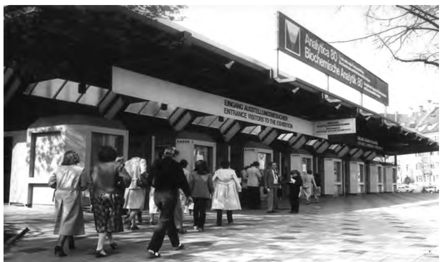
Visitors on their way to the fairgrounds in 1980.